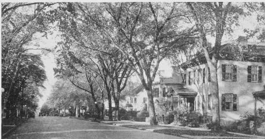
Main Street Geneva