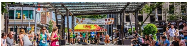
Downtown Ithaca Commons