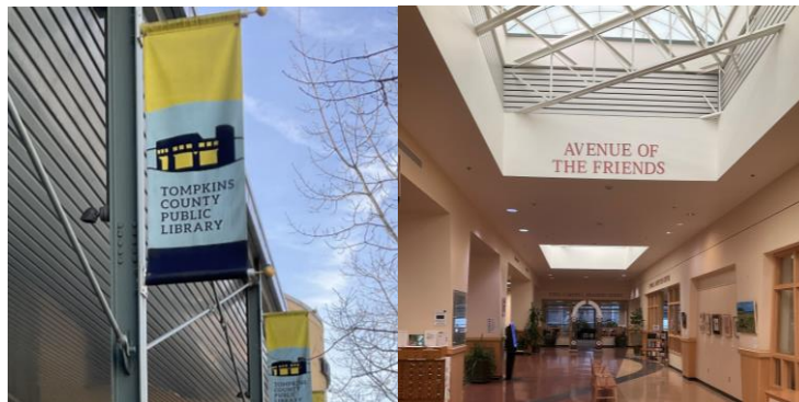
TCPL is celebrating 25 years at its current, modernized home in 2025.

Located in Ithaca, New York, and founded by Ezra Cornell in 1864, the Tompkins County Public Library is an award-winning library with a storied history. It serves the nearly 102,000 residents of Tompkins County, as well as library users at 32 other libraries in four neighboring counties through its role as the Central Library for the Finger Lakes Library System .