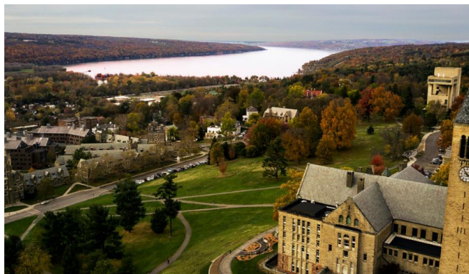
Cornell University & Cayuga Lake

But perhaps it's something more. Maybe it's the buzz from Cornell University and Ithaca College. You feel it everywhere—in our museums, our galleries, and in our restaurants. You hear it in our wineries, theaters, and our Finger Lakes festivals. It grips you as you peruse the fresh produce, local crafts, and art at our renowned Ithaca Farmers Market. You see it downtown on our pedestrian mall, the Ithaca Commons, where PhDs cross paths with street musicians and families stroll the solar system on an interactive "planet walk." You experience it in Ithaca's hotels, B&B's and waterfront cabins.