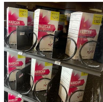
A free NARCAN vending machine unveiled in 2024.

TCPL is also home to a free NARCAN vending machine that is part of its Information Saves Lives project, which uses funds from an opioid settlement and an anonymous donation to the Tompkins County Public Library Foundation to promote harm reduction and combat the opioid epidemic.