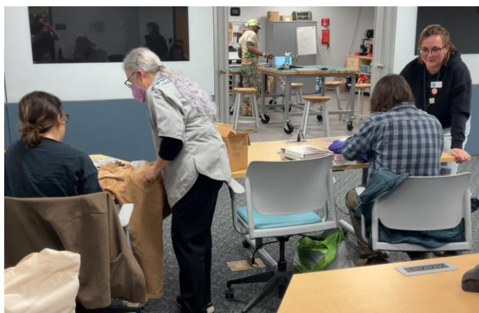
The Digital Lab and Makerspace offer opportunities to learn from local experts using high tech tools such as 3D printers, a laser cutter, sewing and embroidery machines, recording equipment, art & craft supplies, and much more.

Inside TCPL you will find dedicated spaces aimed at making the Library a community hub.