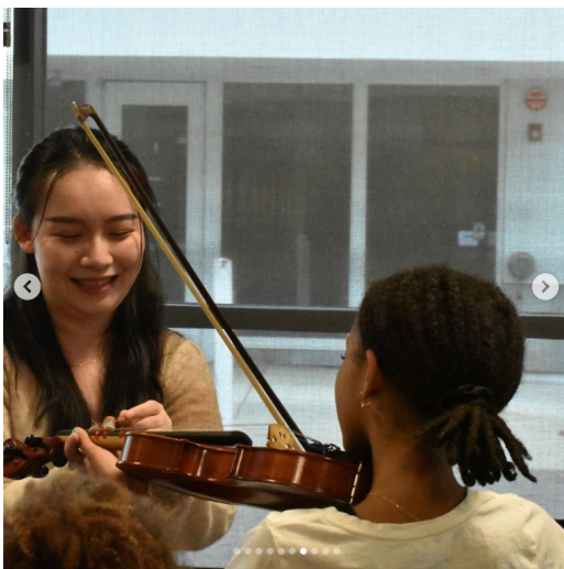
Trying out a violin after the family concert with the Cayuga Chamber Orchestra