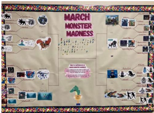
Which Monster will take home the Nessie Cup in our March Monster Madness in the Teen Center?