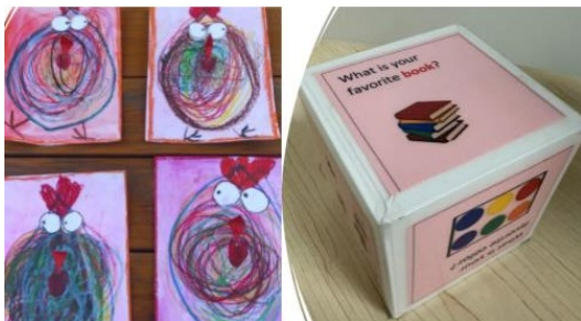
KDT features new activities for student Buddies to explore together