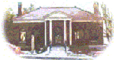
Groton Public Library

Starting in late spring, the five chartered independent public libraries in Tompkins County will mutually honor any library card obtained at any of the five libraries. The campaign, One County, One Card, will solidify residents expectations that one card should be enough.