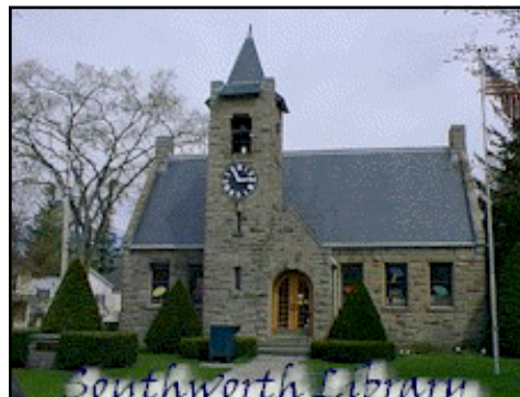
Southworth Public Library (Dryden)