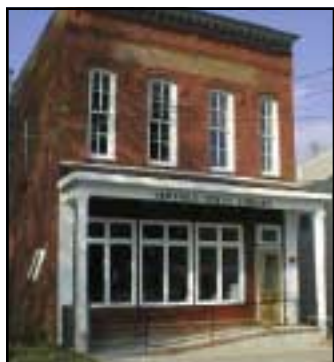
Newfield Public Library

Already these libraries share a common computer catalog and delivery system, and lend library materials