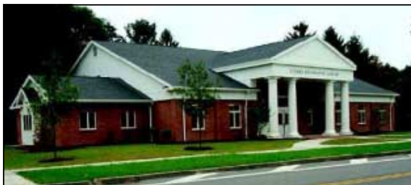
Ulysses Philomathic Public Library (Trumansburg)