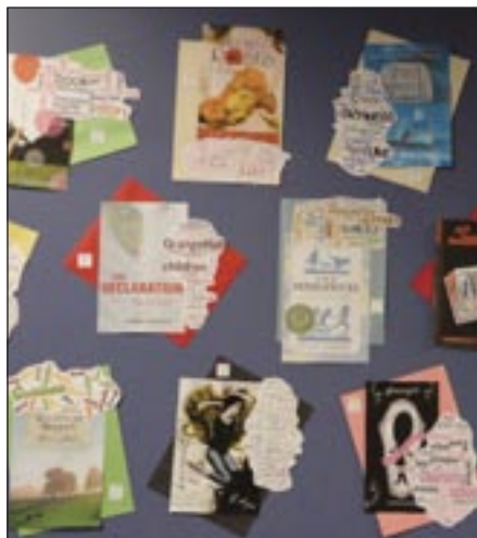
Book reviews become word clouds

More than 40 teens contributed over 300 reviews of a broad range of titles from some of the hottest series of recent years to classic YA literature—from graphic novels to books typically found in our adult literature section—with a bit of non-fiction and drama mixed in as well. In addition to the reviews being posted on the blog, many of them were also displayed, alongside the cover art, as word clouds on the windows of the Youth Services room, and throughout the teen area.