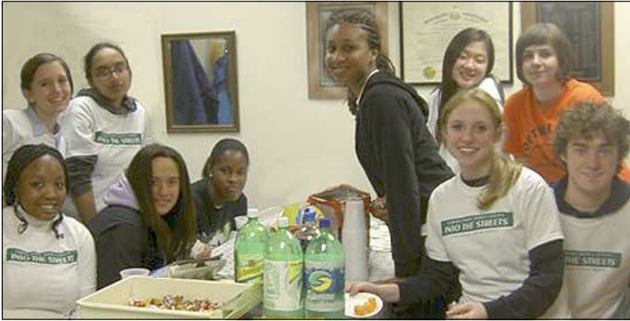
Cornell University Into the Streets Student Group provided great assistance during clean-up.

At the end of the 2006 Fall Booksale it was obvious that this test year of “two equal sales” was a definite success. With the same prices, hours and quality of books at the Spring and Fall sales, total income rose 9% over 2005, with attendance for the year at 35,935 visits! This was a great satisfaction to the dedicated workers who put in over 18,000 hours of hard work. The change in the schedules of the sales was also appreciated by the volunteers. In the past, the Fall sale ran for nine days before a break—the result was an exhausted group of volunteers. With the three day on, four day